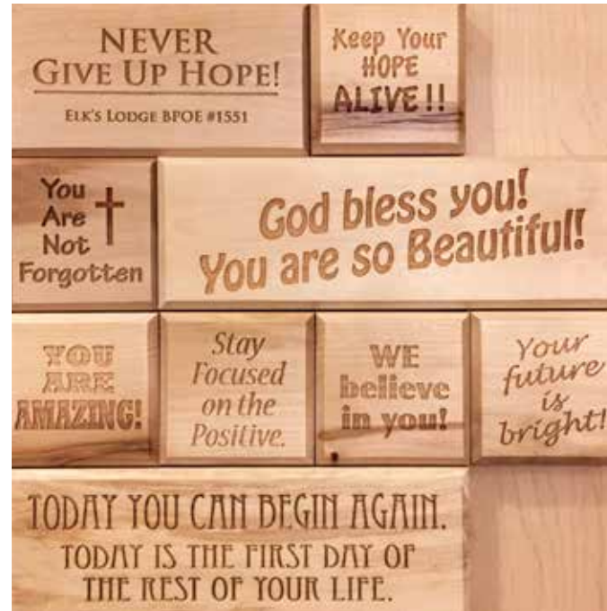
Positive messages from the community greet the kids every time they open their bedroom door.