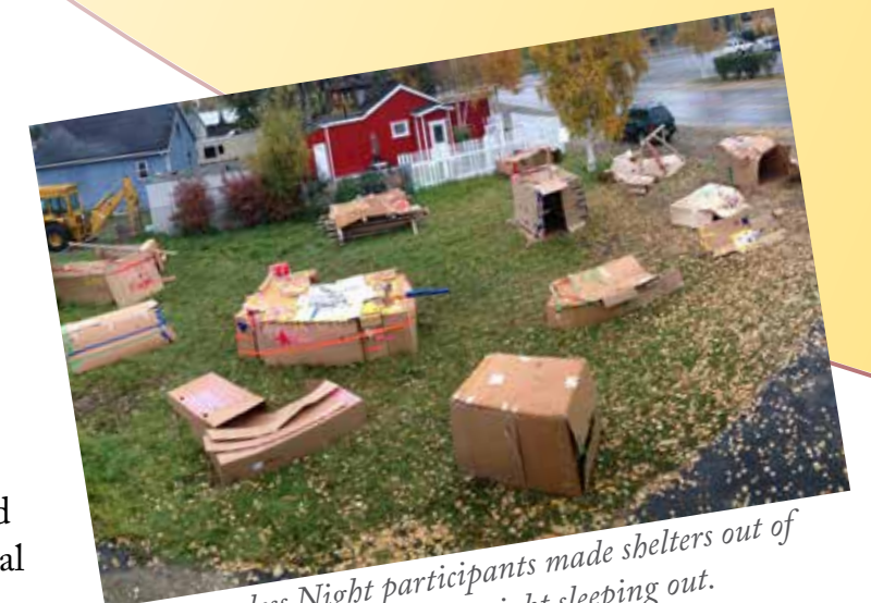
One Homeless Night participants made shelters out of cardboard boxes and spent a night sleeping out.

this year! A special thank you to the breakfast crew and the Ft. Wainwright 65th Ordnance Company who watched over us as we slept! A special thanks to our One Homeless Night sponsors.