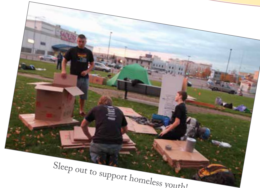
Sleep out to support homeless youth!

Facilitating life transitions for at risk youth